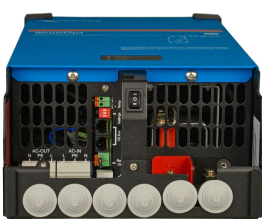
MultiPlus 2000 VA (bottom cover removed)