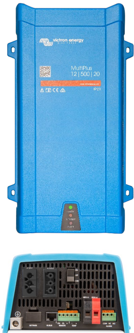
MultiPlus 500 / 800 / 1200 / 1600 VA