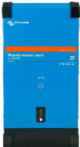
Phoenix Inverter Smart 12/3000